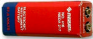
Industry Standard Dimensions in mm (inches)